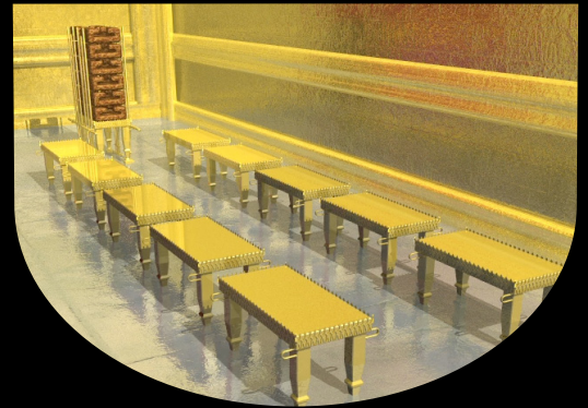
10 tables that Shlomo HaMelech added to the Bais HaMikdash